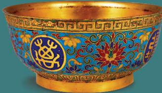
A Chinese Qianlong Period cloisonné and champleve enamel bowl Sold for £72,000