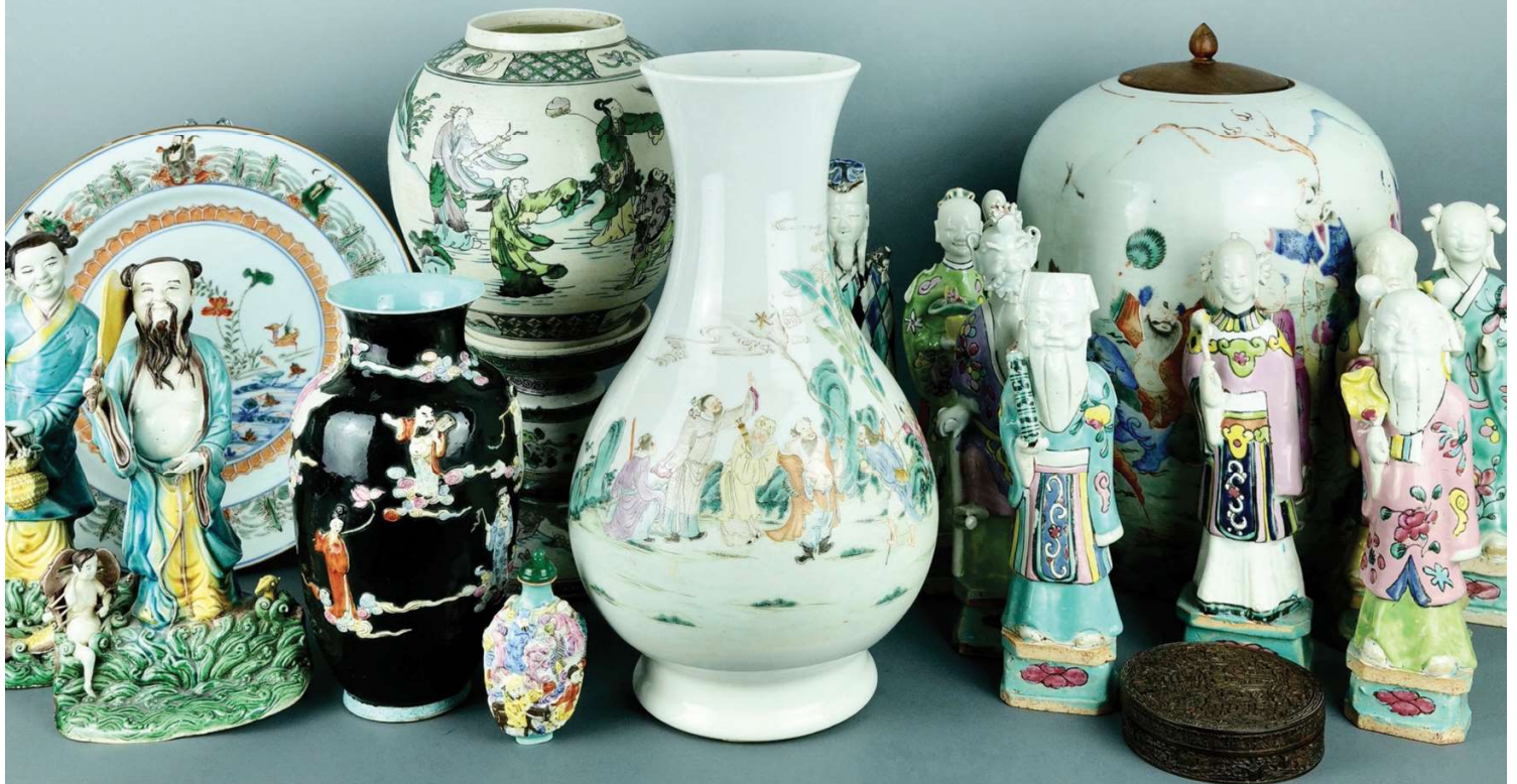
Above: Smiling Gods of Ancient China – a collection of Eight Daoist Immortals in 2025 Spring's Asian Art Sale. Top of page: detail of a Daoguang period Hu-shaped vase from the same collection.

Our efficient and secure in-house shipping service ensures seamless delivery to buyers across the UK, Europe, and beyond.