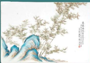
A Chinese porcelain rectangular plaque in the manner of Xu Zhongnan Sold for £42,000