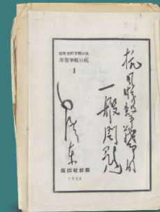
A copy of Mao Zedong's "Protracted War" with signature on the cover Sold for £27,000