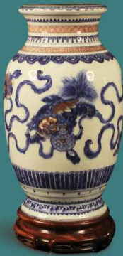
A Chinese porcelain lantern vase, Qing Dynasty Qianlong period Sold for £20,000