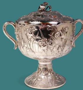
A Japanese Meiji period silver pedestal bowl and cover, by Y Konoike Sold for £5,400